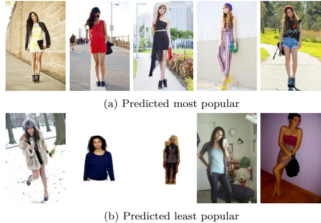
Figure 4: Prediction examples from our combined model.