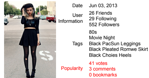
Figure 1: An example of a Chictopia post.

http://dx.doi.org/10.1145/2647868.2654958 .