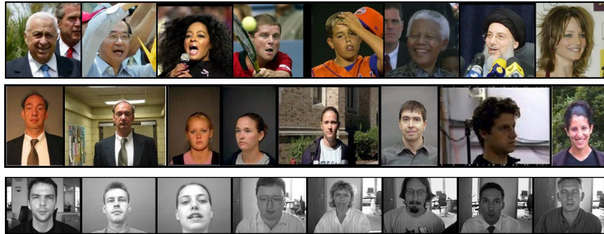
Fig. 1. Sample images from LFW (first row), FRGC (second row), and BioID (third row), representative of variation within each database ( best viewed in color )